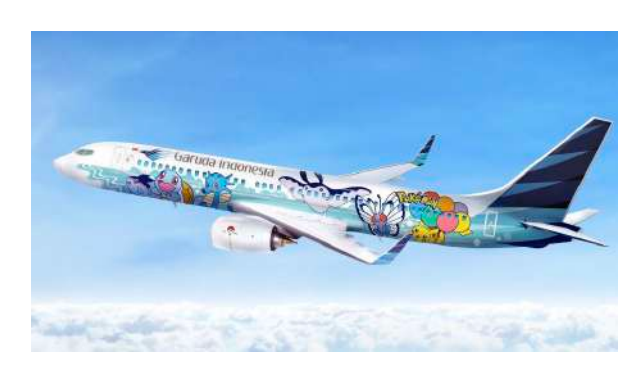
Garuda's Pokemon Jet