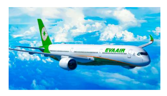
EVA Air's A350 Order | © Airbus