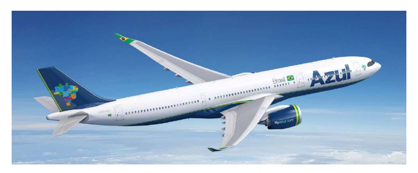
Azul adds on to A330neo order

Azul has added on to its order of A330neos, with a firm order for 4 additional A330-900s from a purchase agreement in June 2023. With these aircraft, the airline will expand its fleet and international route offering. These new aircraft will replace their 4 A330-200s and 2 A350-900s in their fleet.