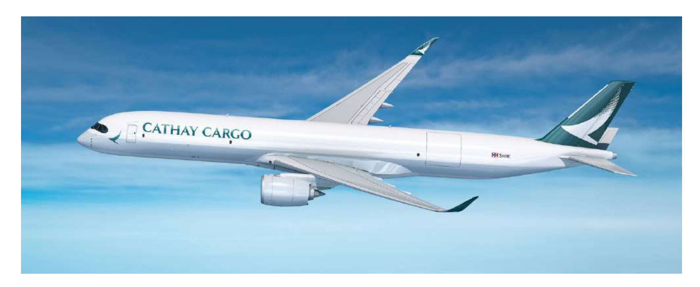
Cathay Cargo's new A350F