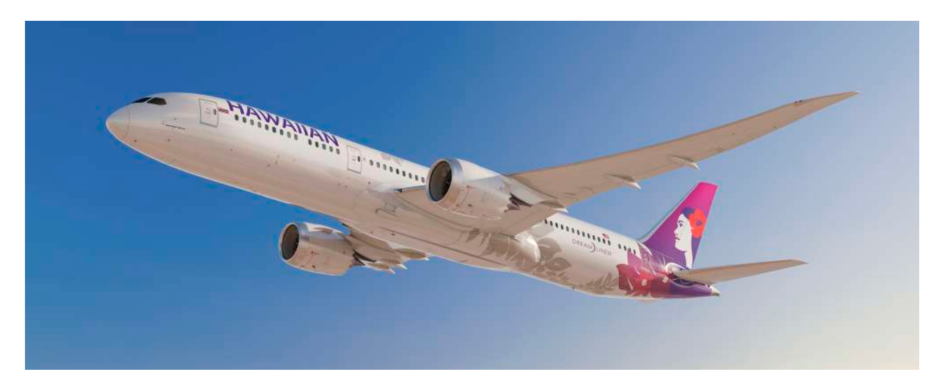
Hawaiian Airlines' new Boeing 787

Alaska Air Group- consisting of Alaska Airlines and regional carrier Horizon Air has announced the acquisition of Hawaiian Airlines in a deal worth USD 1.9 Billion- including around $900 million of Hawaiian Airlines' debt.