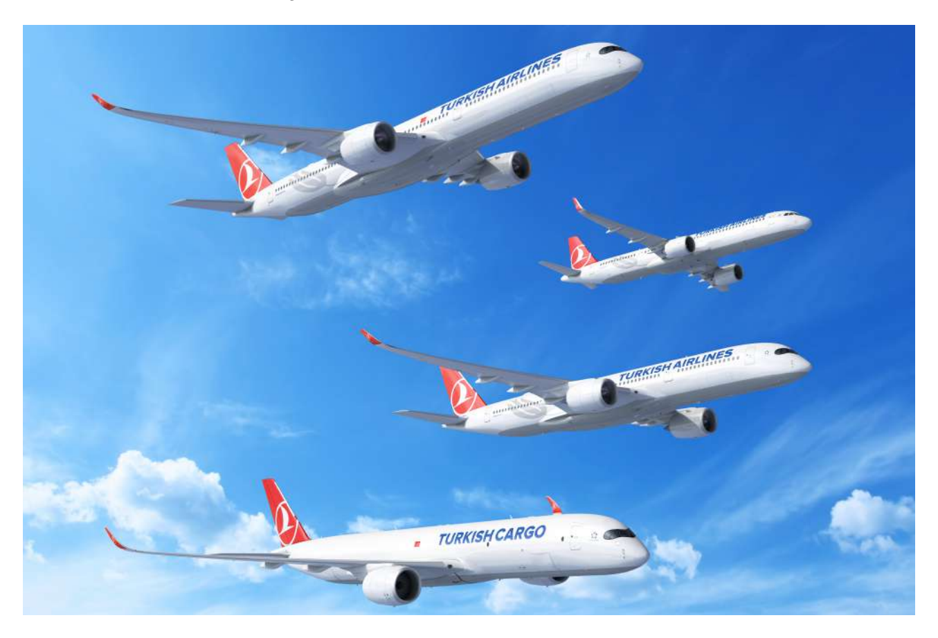
Turkish Airlines' Massive Airbus Order | © Airbus

Turkish Airlines has confirmed an order with Airbus for 220 new aircraft. This brand-new order consists of 150 A321neos, 50 A350-900s, 15 A350-1000s and 5 A350F (Freighters). This follows two orders from the airline for 10 A350-900s in September and four A350-900s in July 2023.