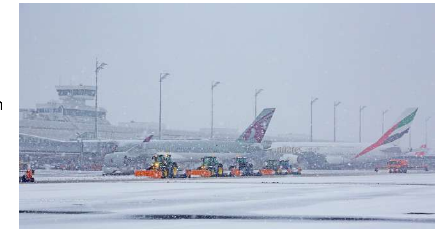
Munich Airport covered in snow

airports were hit with severe snowy conditions which delayed, diverted and cancelled hundreds of flights. Due to "heavier than forecasted snow", Glasgow airport shut down on 2 December from 7.24am to noon, and Munich airport was forced to close for nearly 24 hours that same day.